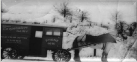
Brant Cooperative Dairy